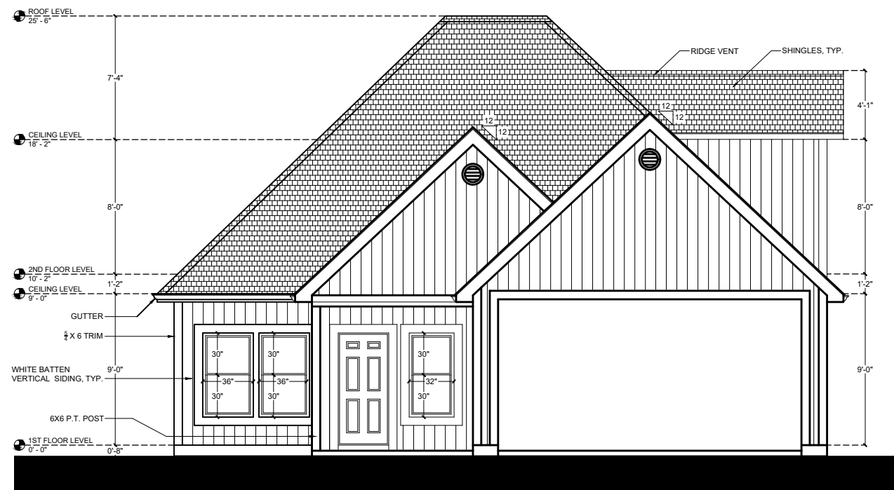
FRONT ELEVATION / EAST Scale: 1/8" = 1' - 0"