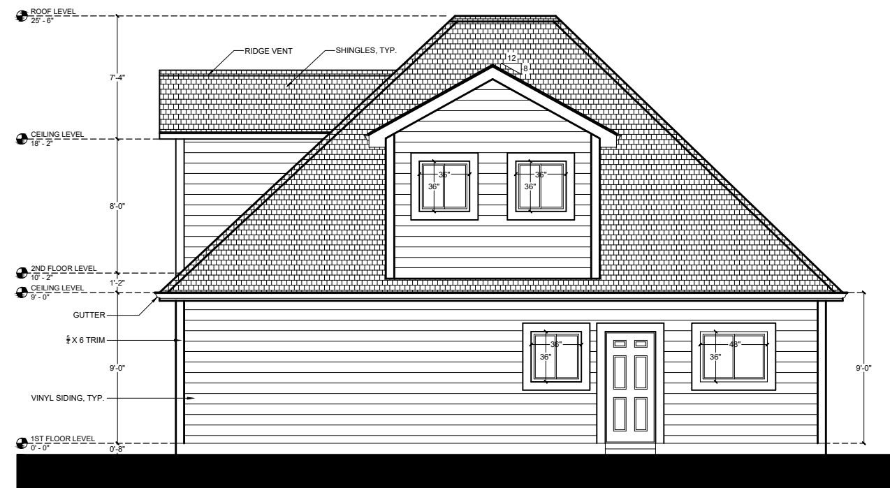
BACK ELEVATION / WEST Scale: 1/8" = 1' - 0"